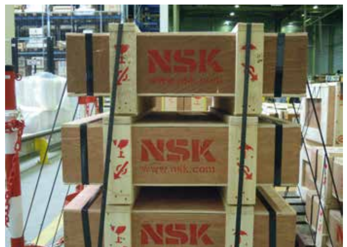
Correct NSK Logo on wooden boxes

If you have any concerns about an NSK product that you have purchased, please contact your local Distributor or NSK Europe directly at: info-uk@nsk.com . Your inquiry will be directed to the relevant sales person for your area.