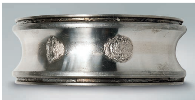
Typical signs of fatigue: small, flat flakes of the bearing material become detached (flaking/spalling).

In addition to natural wear and tear, bearings can fail (prematurely) due to other factors such as extreme temperatures, cracks, lack of lubrication, or damage to the seals or cage. Bearing damage of this kind is often the result of choosing the wrong bearings, inaccuracies in the design of the surrounding components, incorrect installation or insufficient maintenance.