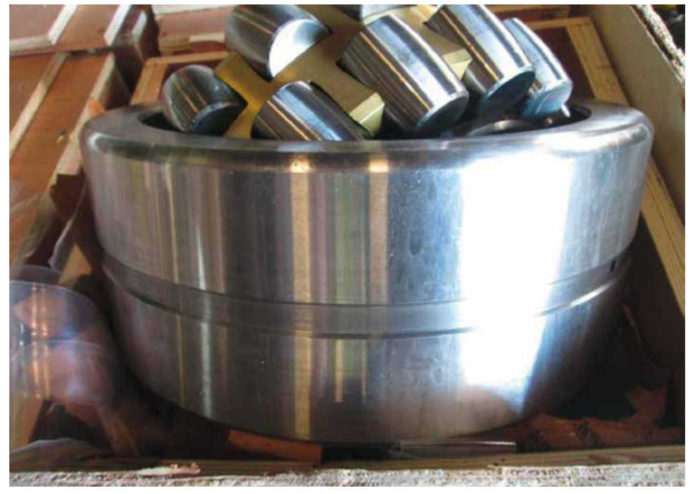
Is the above a counterfeit bearing? Yes – because original bearings would have more oil holes, chamfer should not be polished and there must be dimples at the roller ends.