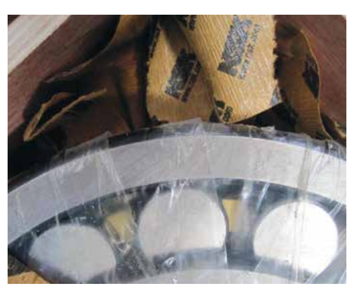
Although they look similar in general appearance, you can see several areas in which they are different including dimples on the roller ends.