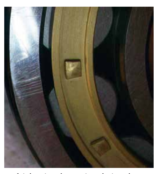
NSK single piece machine brass cage with broached pocket. Counterfeit bearing shows: rivet designed cage.