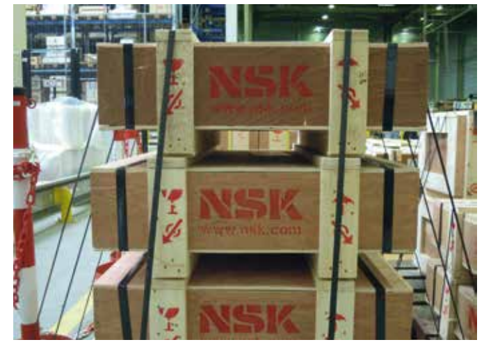
Correct NSK Logo on wooden boxes

If you have any concerns about an NSK product that you have purchased, please contact your local Distributor or NSK Europe directly at: info-uk@nsk.com. Your inquiry will be directed to the relevant sales person for your area.