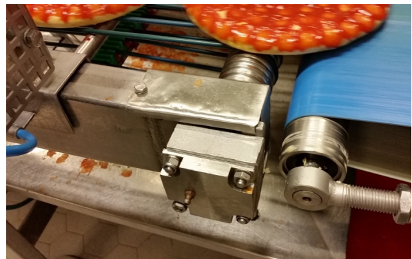
↑ Production line of frozen pizza