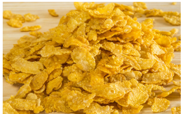
↑ Cereal Manufacturing