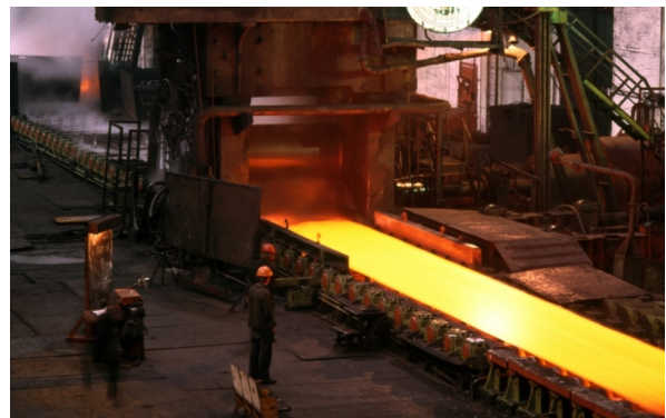
↑ Plate Rolling Mill