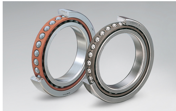
↑ Mounting training for Super Precision Bearings