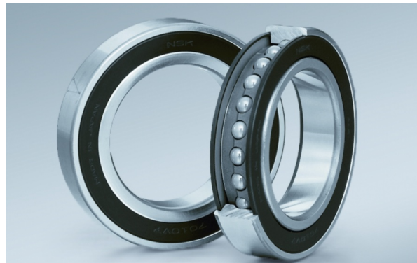
↑ Sealed Super Precision Bearing