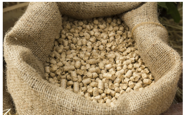
↑ Animal Feed Plant Conveyor