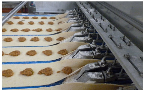
↑ Snack Foods Manufacturer