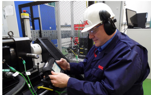
↑ Condition Monitoring Service (CMS)