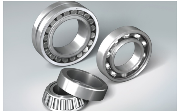
↑ Bearings TF Series