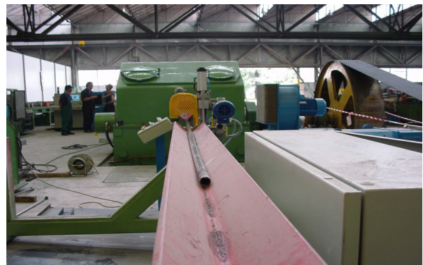
↑ Seamless Stainless Steel Pipe and Tubes