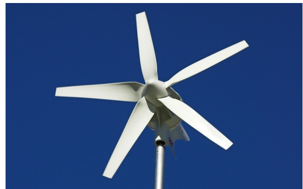
↑ Wind Turbine